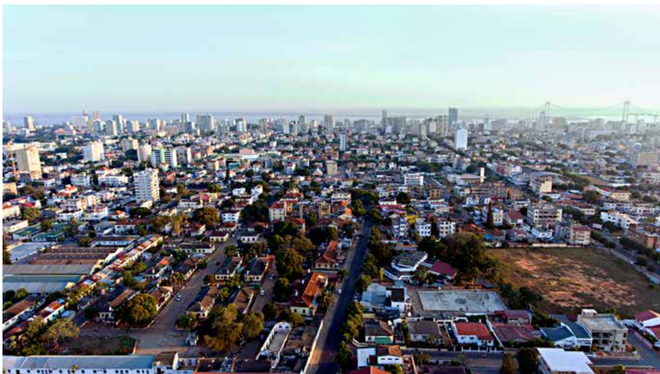
Aerial view of Maputo City.