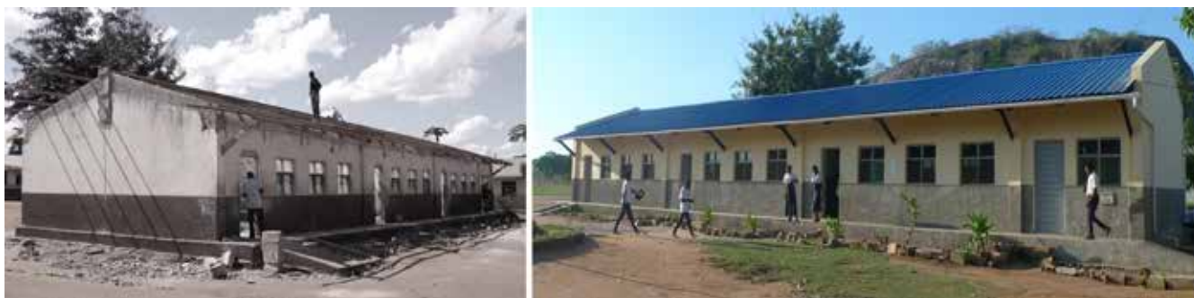
Post-disaster school reconstruction in Nampula using the methodology "Build Back Better", 2019