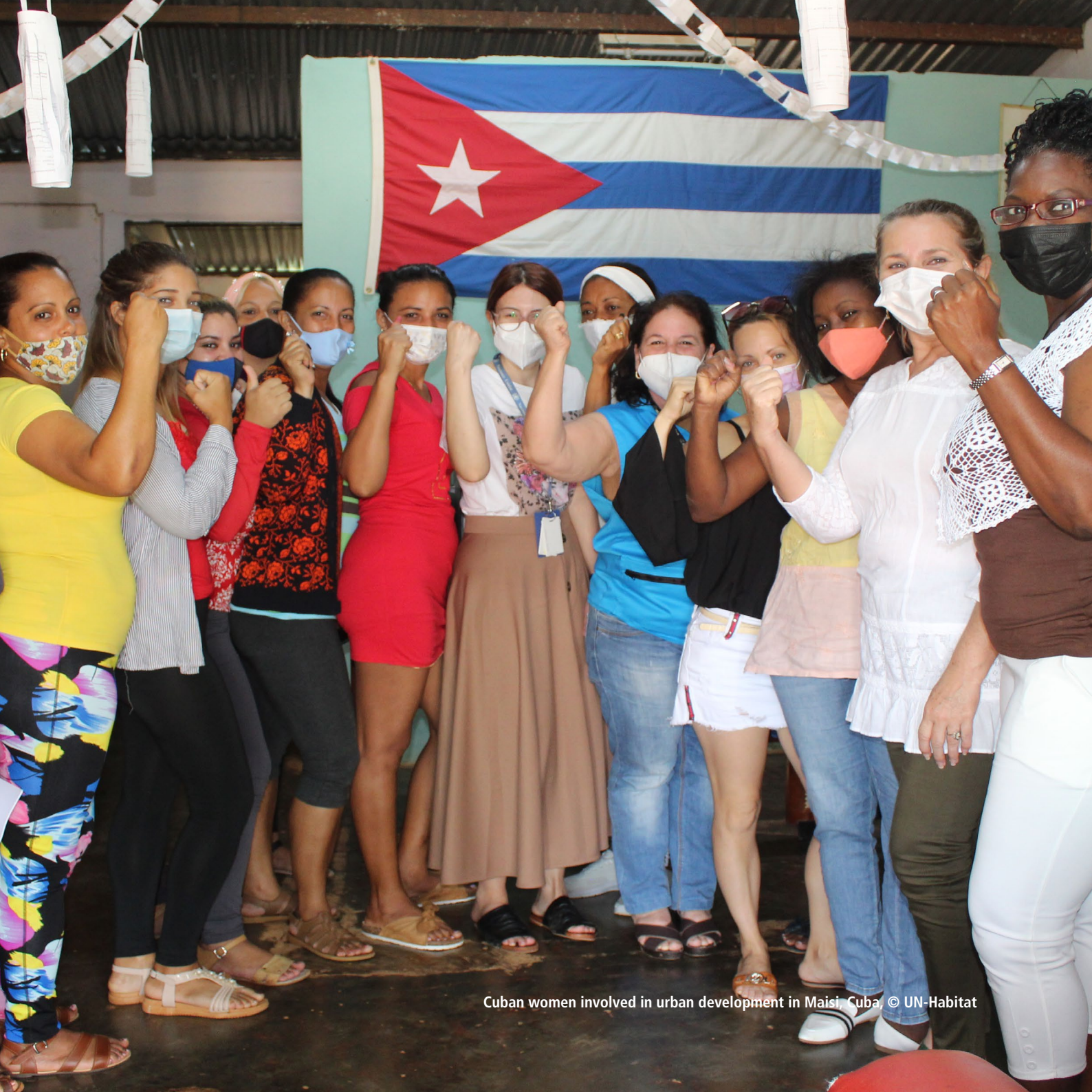
Cuban women involved in urban development in Maisí, Cuba, © UN-Habitat