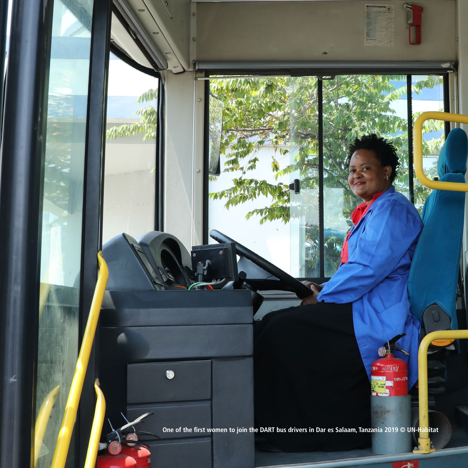
One of the first women to join the DART bus drivers in Dar es Salaam, Tanzania 2019