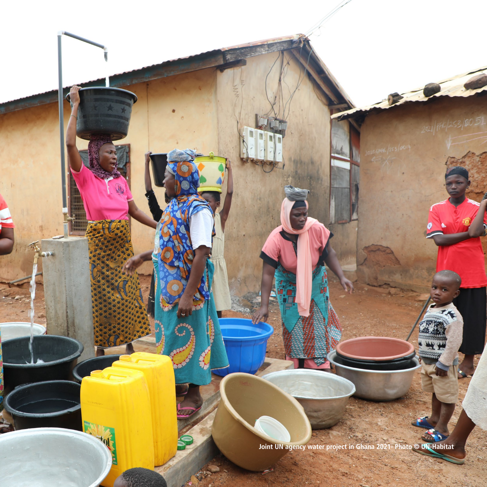
Joint UN agency water project in Ghana 2021