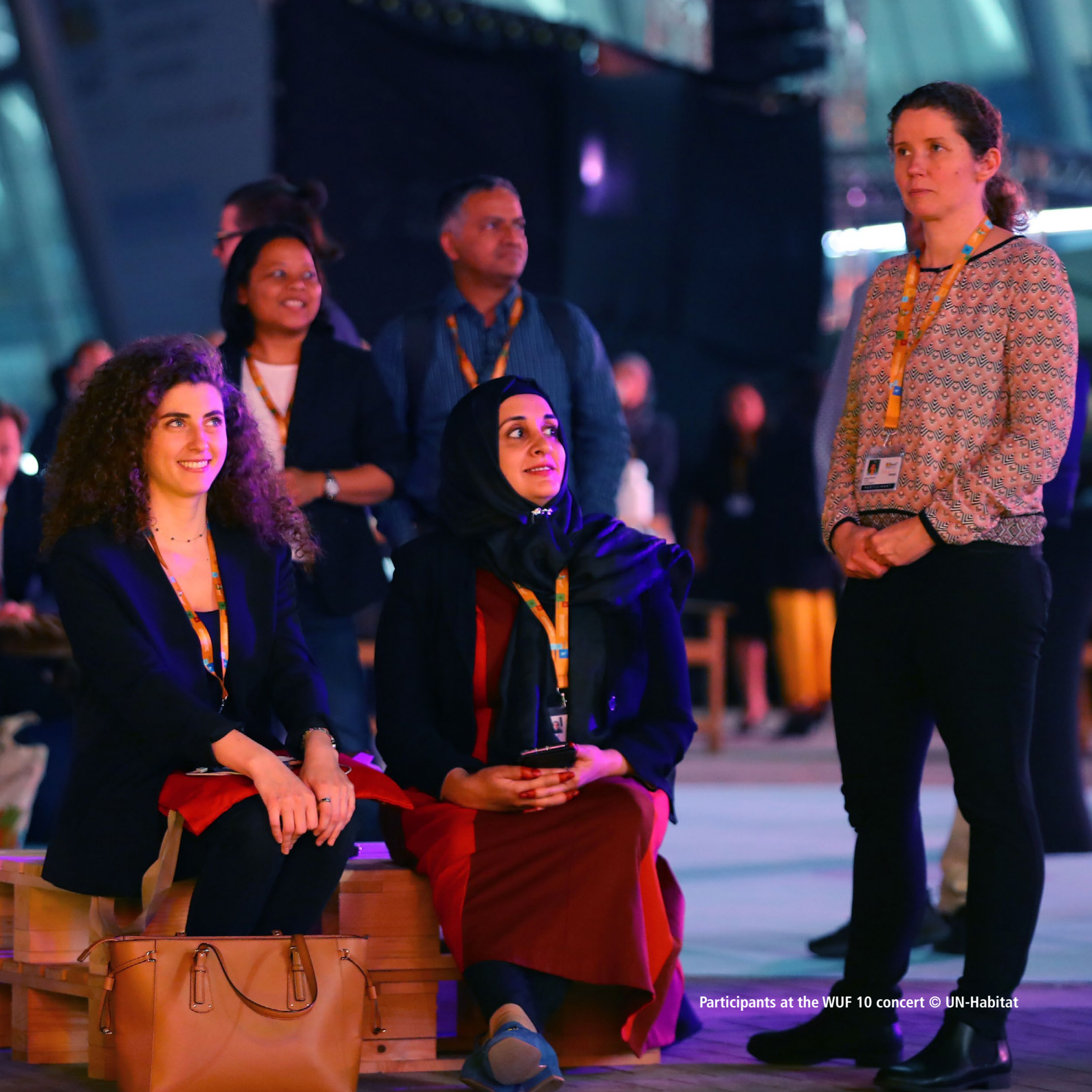
Participants at the WUF 10 concert