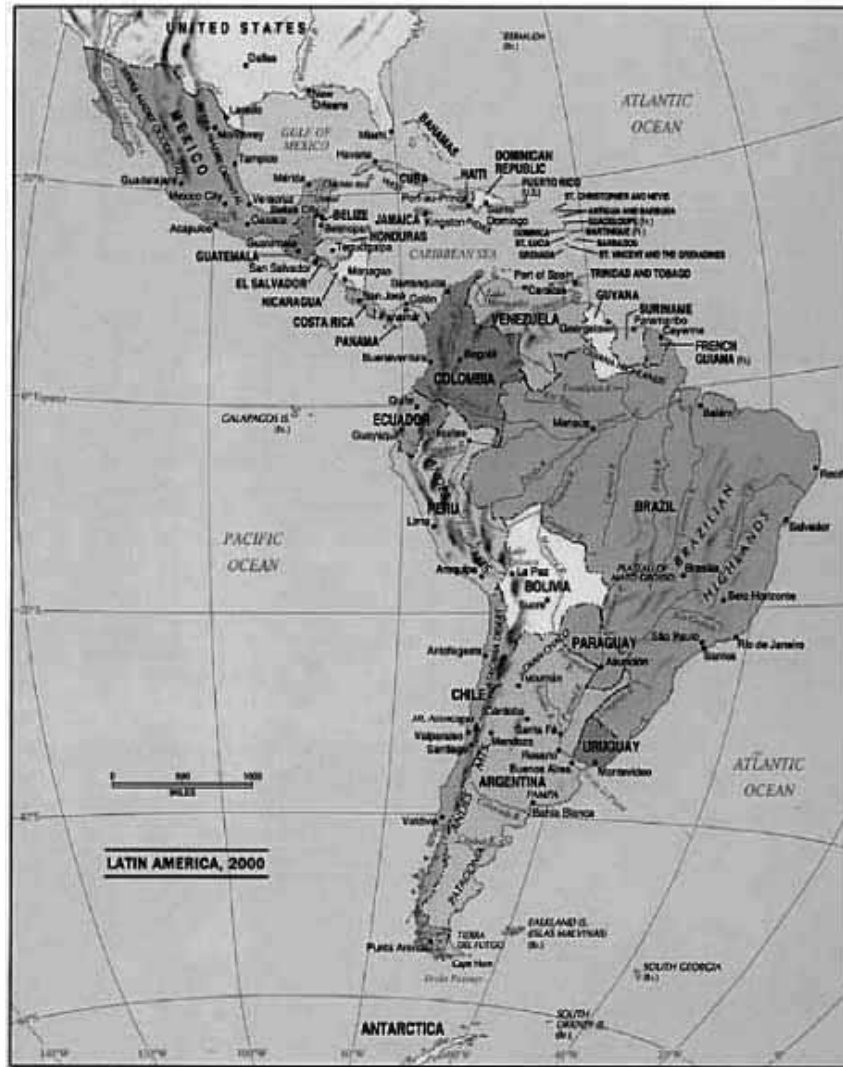
Figure 1.1 Map of Latin America