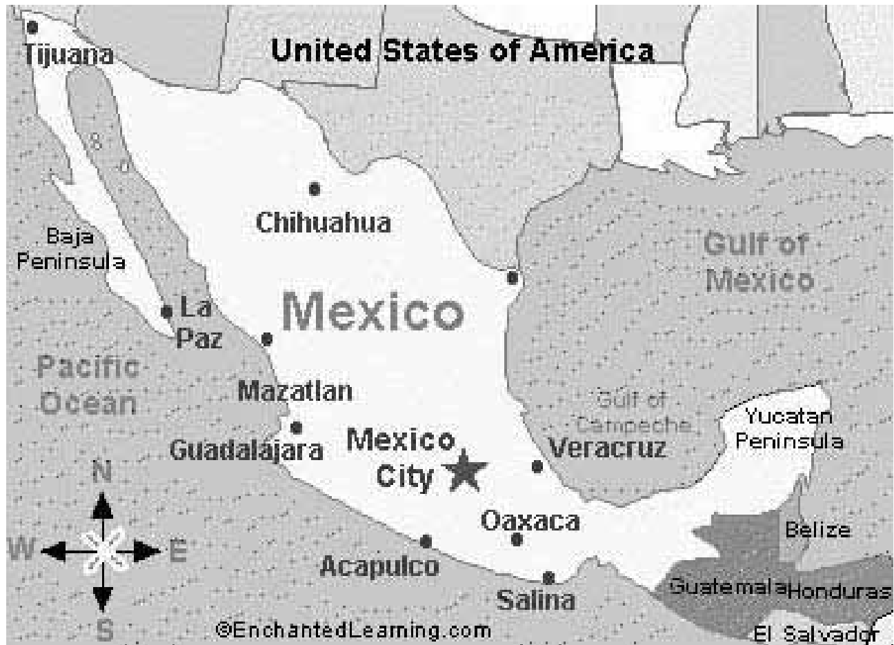
Figure 1.1: The Mexican Republic

The final sections draw on information provided in the previous parts of the report. The best practices section tries to identify any positive and possibly replicable practices that have emerged. The conclusions section flows from the previous section, identifying problems and constraints to land and housing rights delivery. The final part of the report makes recommendations. These are designed to be realistic, taking into account the specific conditions in each country, within the context of the region.