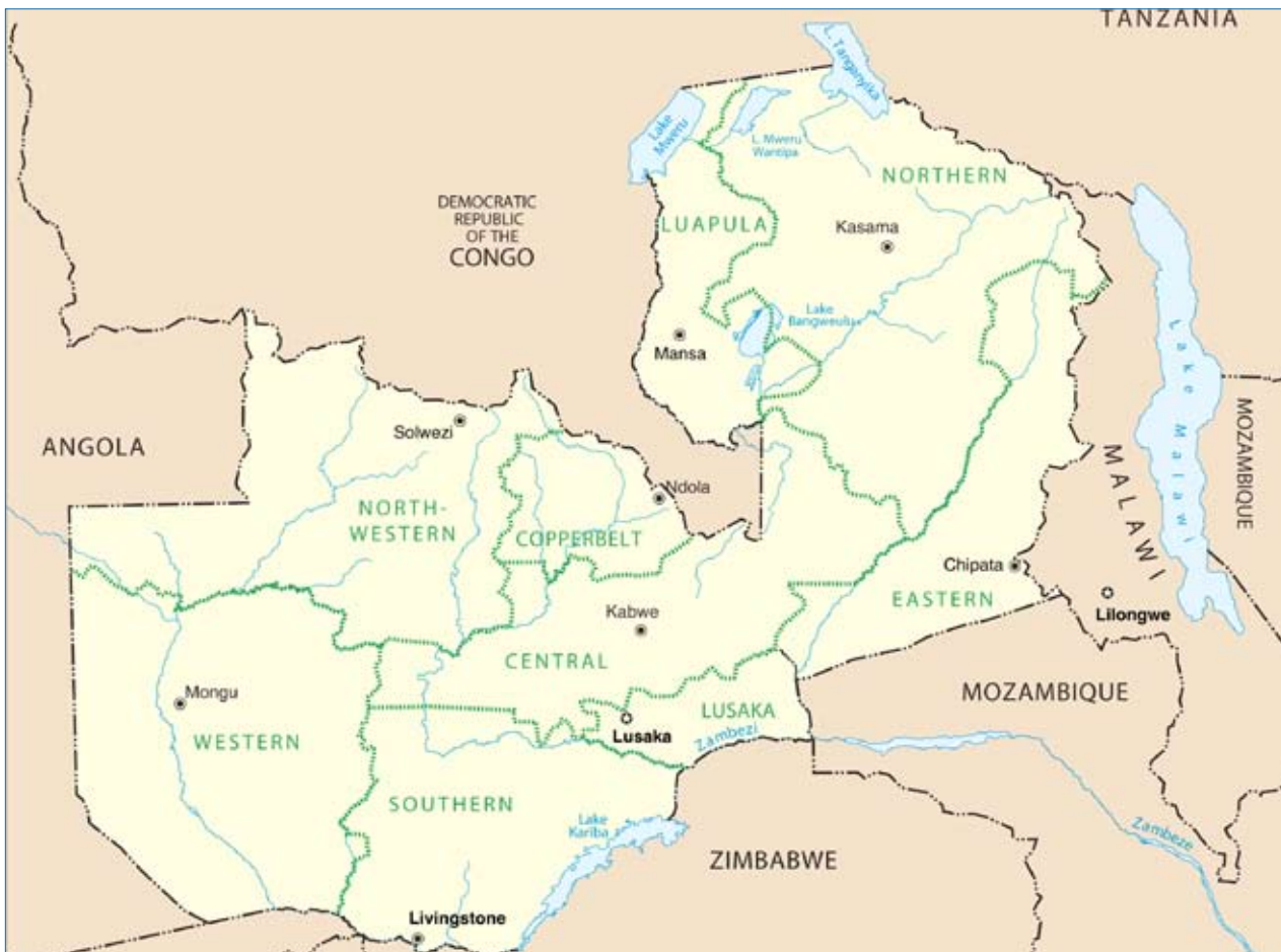
MAP 1: LIVINGSTONE AND ITS SURROUNDINGS

Livingstone, the capital of Northern Rhodesia before independence and before Lusaka became the capital, is the largest town in Zambia's Southern Province. The city is the tourist capital of Zambia and has the potential to be the number one tourist destination in southern Africa. Among the tourist attractions, Livingstone city boasts Victoria Falls, the seventh wonder of the world. The Livingstone District area is 672 km 2 , with an estimated population of 114, 000 inhabitants. Livingstone is the main administrative centre for the southern region of Zambia and it is the main entry point into the country by road from southern African countries such as Zimbabwe, Botswana, and South Africa. However, Livingstone as a district has a number of development gaps: unequal distribution of infrastructure development, inadequate provision of social services, high poverty levels, degradation of the environment and natural resources, unemployment, and, for much of the city, underdevelopment.